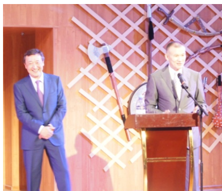
Allocution of the Minister of Justice