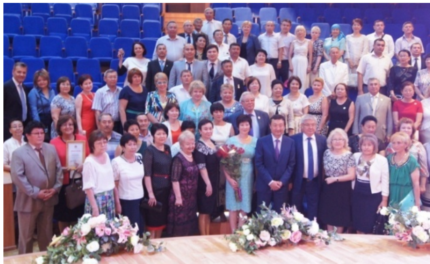
Group picture at the Awards Ceremony

On June 26, 2014 at the Tilen Kobiz Sarai Concert Hall in Astana, the Republican Collegium of Lawyers held a ceremony where medals and various types of awards were delivered to State bodies, lawyers, international organizations, public activists and journalists for services rendered to the Republican Collegium, the legal profession or for professional excellence.